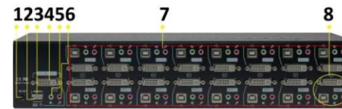
EW-K2316DU2 Back-Panel overview